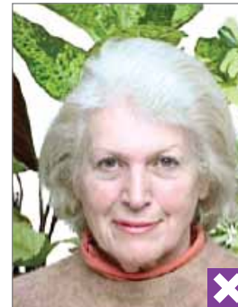
The background is not light grey or cream