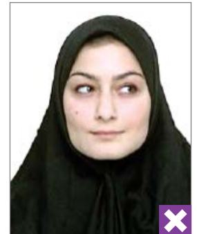
The subject must be looking at the camera