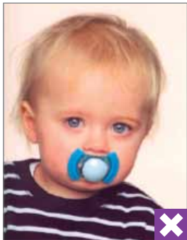
The face must not be obscured