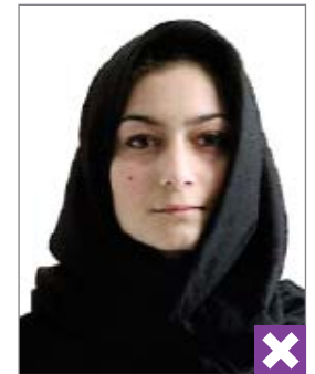
The face must not be obscured by shadow or head covering

If photos don't meet with our standards, we will ask you for another set and this will delay your application.