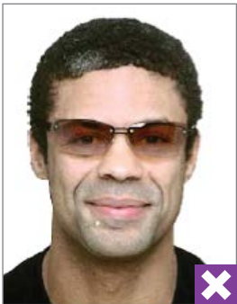
Eyes must not be obscured