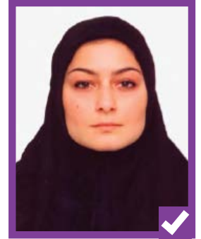
Head coverings for medical or religious reasons only