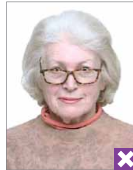
Glasses must not cover the eyes