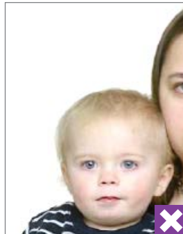
The photograph must feature one person