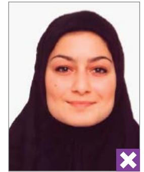
Smiling distorts the normal facial features