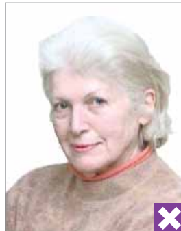
The subject must not sit at an angle