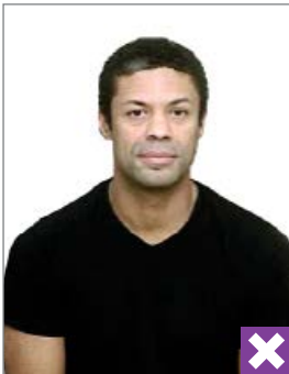
Too far away