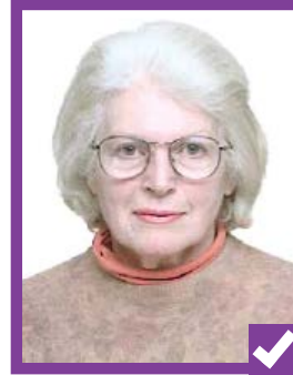
Acceptable – where possible remove glasses